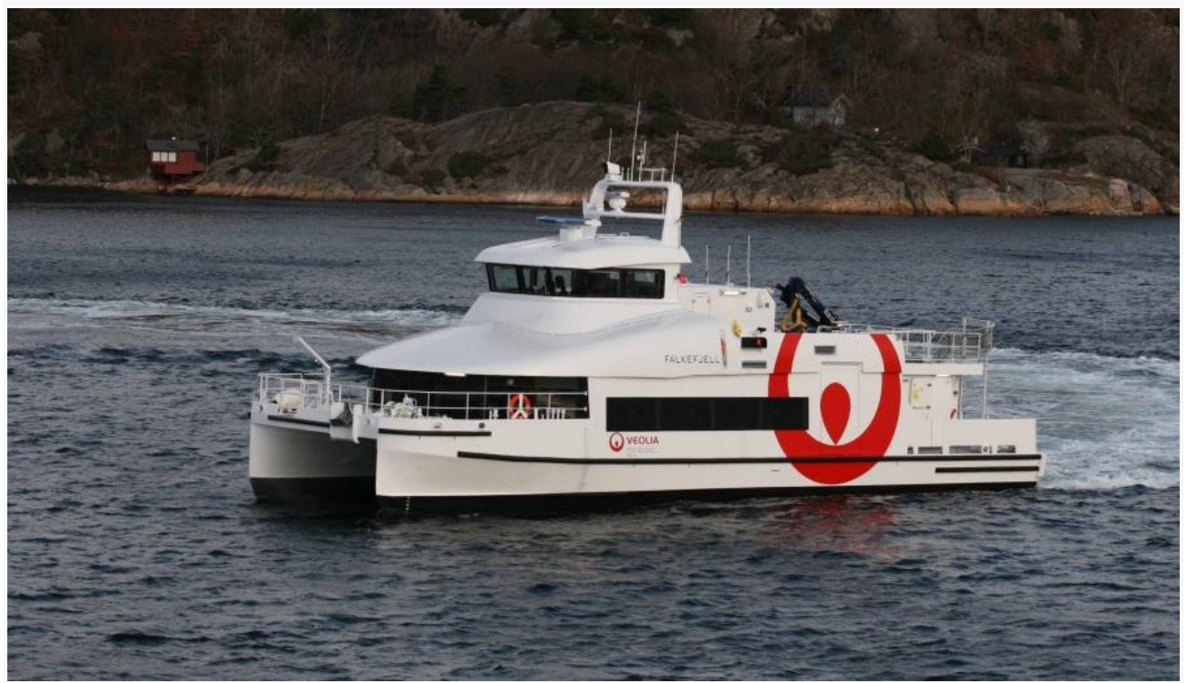
High Speed vessel with unique sea going capacities, lightweight, less fuel, less emission.

These High-Speed passenger vessels are more" on-time" with a punctuality at an average rate of 95 %. Carbon Cat with a reduction of fuel consumption at 57 % and a reduction of NOX/emission at 66 %.